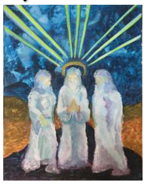
Sunday February 11, 2024